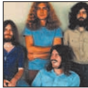
Stairway to Heaven LED ZEPPELIN

While these are only a few of the multitudinous unforgettable songs in the Rock cannon, I find this list has left a unique legacy of values upon our generation. They have become a part of our psyches and still act as living mantras, activating us to higher levels of consciousness upon hearing them. And this is only my opinion, I sure everyone will come-up with their own unique selections. Nevertheless, I present here portions of each song - to revitalize our youth, gain awareness of perception and to connect us to our roots. Long love rock and roll!