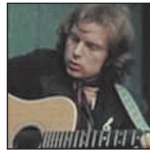
Moondance VAN MORRISON

the genius of Joni is the simplicity of her poetry, the beauty of her melody and the wisdom of her words. This song weaves a child's confusion about clouds with a teenager's bewilderment of love and an adult's illusions with life. Dreams and schemes and circus crowds I've looked at life that way. But now old friends are acting strange. They shake their heads they say I've changed. Well something's lost, but something's gained in living every day. I've looked at life from both sides now from win and lose and still somehow it's life's illusions I recall I really don't know life at all.