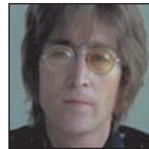
Imagine JOHN LENNON

people bowed and prayed to the neon god they made. And the sign flashed out its warning in the words that it was forming. And the sign said, 'the words of the prophets are written on the subway walls and tenement halls.' And whispered in the sounds of silence.