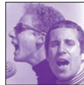
Sounds of Silence SIMON & GARFUNKEL