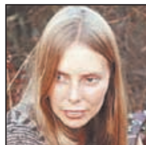
Both, Sides Now JONI MITCHELL

Combining Hindu mantras and the wonders of space, the Beatles get really quantum here. Lennon and McCartney predict the coming of the age of science and cosmic consciousness. Sounds of laughter, shades of life, are ringing through my open ears exciting and inviting me: Limitless undying love, which shines around me like a million suns, it calls me on and on across the universe. Jai guru deva, om! Nothing's gonna change my world.