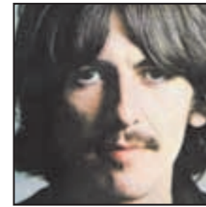
Something GEORGE HARRISON

He has had many hits but none topped this anthem to the mystery of love's magic. With one of the most hypnotic and mystical melody of all times, it is a tribute to the pagan's rites of autumn. Well, it's a marvelous night for a moondance with the stars up above in your eyes. A fantabulous night to make romance 'neath the cover of October skies. And all the leaves on the trees are falling to the sound of the breezes that blow and I'm trying to please to the calling of your heart-strings that play soft and low. And all the nights' magic seems to whisper and hush and all the soft moonlight seem to shine in your blush.