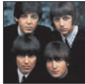
Across The Universe THE BEATLES

peace will guide the planets and love will steer the stars. This is the dawning of the Age of Aquarius...Harmony and understanding, sympathy and trust abounding. No more falsehoods or derisions. Golden living dreams of visions, mystic crystal revelation and the mind's true liberation, Aquarius!